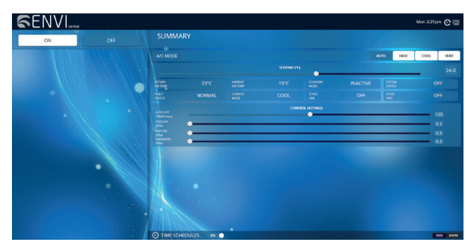
Take Control of your A/C system from the ENVI Central Web Interface.