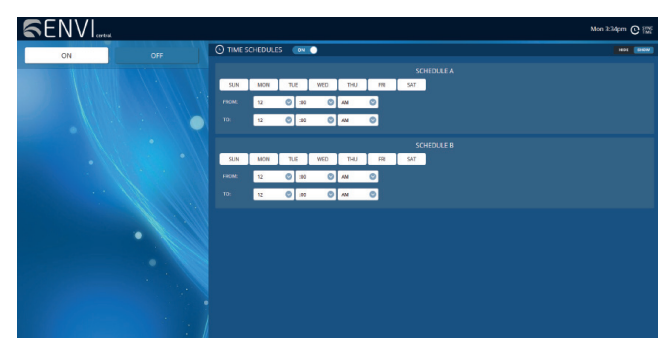
Create Individual Zone Time Schedules to Suit your Needs.