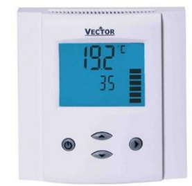
Figure 3: OPA